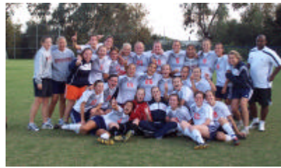
2005 SCIAC Champions